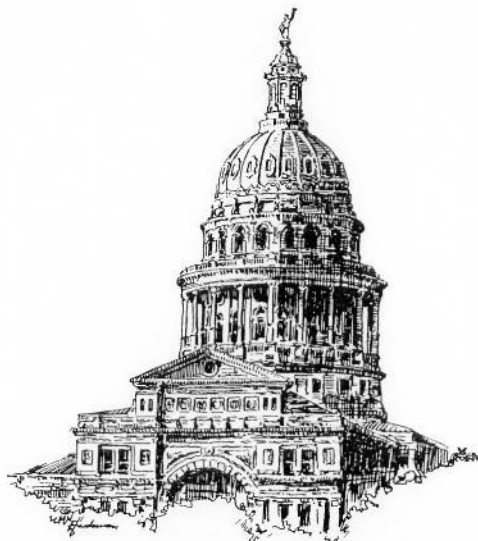
CAPITOL DOME AUSTIN, TEXAS

Despite the increase in total pending, there were actual decreases in the number of pending cases in which discretionary review had been granted, and in the number of pending applications for writs of habeas corpus. On August 31, 1985, there were pending 231 granted discretionary review cases, 274 applications for writs of habeas corpus, 901 petitions for discretionary review, and 276 direct appeals, death penalty appeals, granted habeas corpus writs, and extraordinary writs.