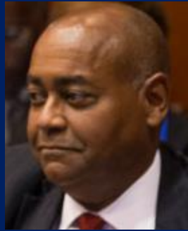
Senate Sponsor: Senator Rodney Ellis, et al.

The TCERC was created under but independent from the Texas Judicial Council, and is administratively attached to the Office of Court Administration.