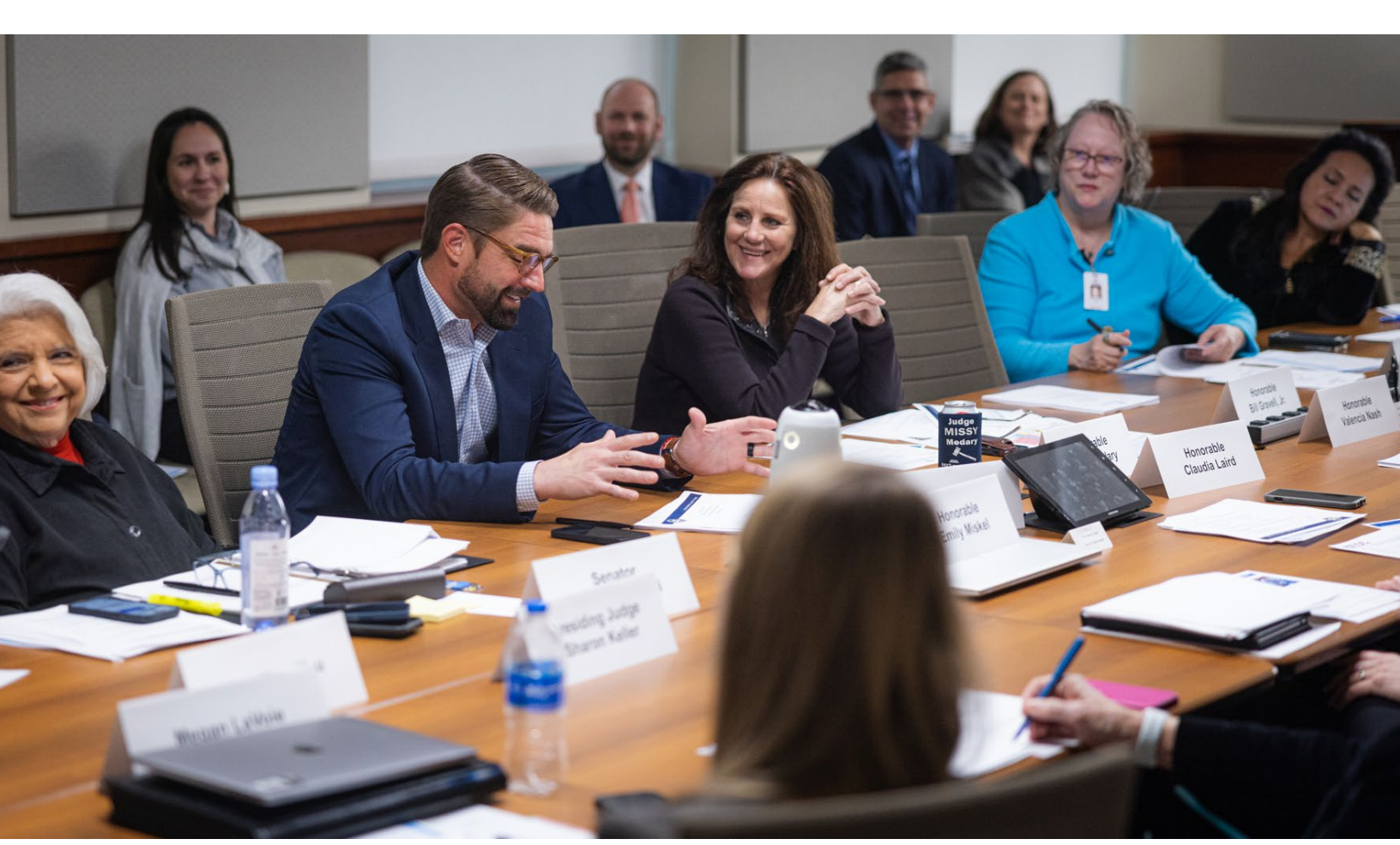
Texas Judicial Council meeting, February 24, 2023