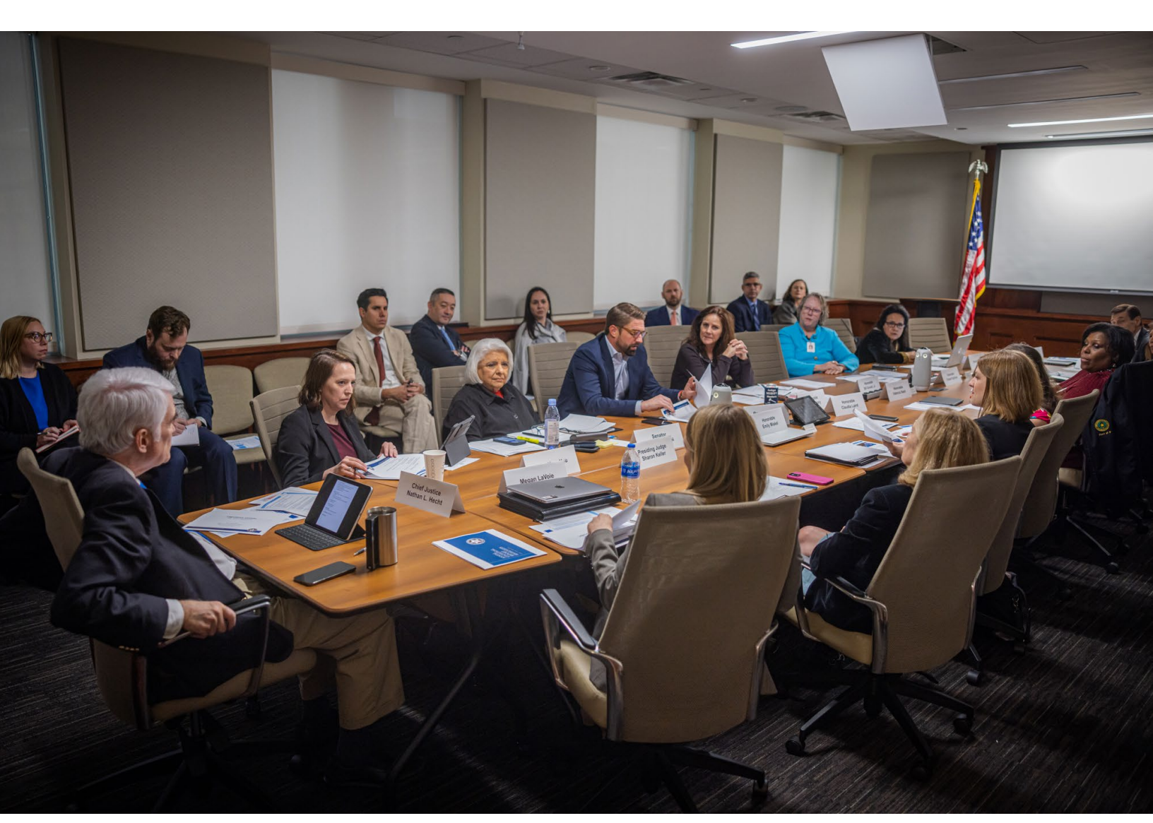
Texas Judicial Council meeting, February 24, 2023