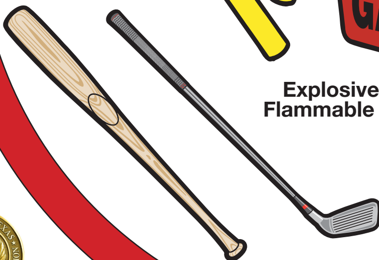
Sports Equipment/ Clubs

These examples represent some of the types of items that are prohibited in this facility. ANY item deemed dangerous or offensive by court security staff is prohibited. Confiscated/surrendered items may not be returned. Possessors of illegal weapons or contraband are subject to arrest.